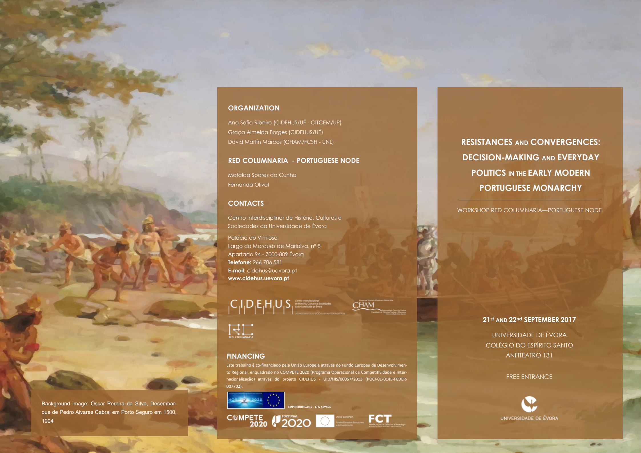
Background image: Óscar Pereira da Silva, Desembarque de Pedro Alvares Cabral em Porto Seguro em 1500, 1904